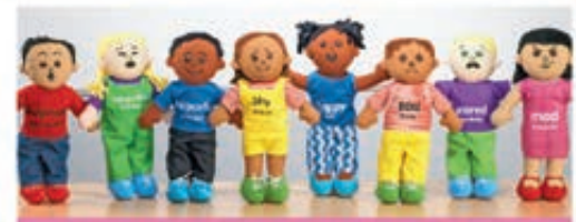
social & emotional