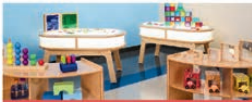
STEM & curriculum